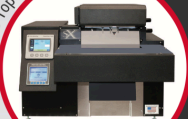
Table-Top to Integrated Inline Solutions