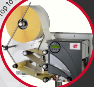
Table-Top to Integrated Inline Solutions