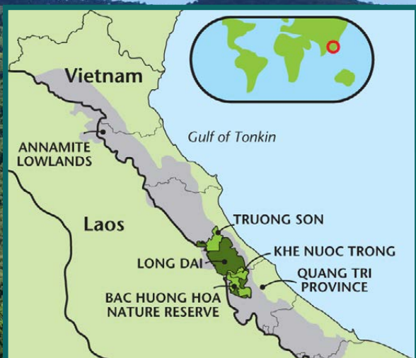
Khe Nuoc Trong in Vietnam, one of the most biologically diverse countries on Earth

Carbon Balanced Paper supports World Land Trust projects in Vietnam, one of the most biologically diverse countries on Earth and an area of international conservation importance.